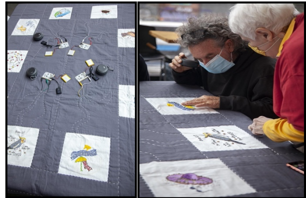
Figure 4. Delicious Memories , 2021-2022.

The intention of Delicious Memories was to link tactility to listening to enhance deep listening and bring the listener emotionally and empathically closer to the audio story [2]. Unable to hear the digital audio stories, the hearing-impaired visitors to the installation picked up the small Bluetooth speakers while touching the tactile sensors. Their joyful expression of inclusion into the sonic world through the two haptic forms of texture and vibration was evident.