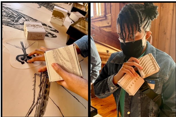
Figure 3. Visitors to the installation interacting with sensors and boxes

Our interest in creatively re-imagining human hearing is drawn from several sources, including direct experience with hearing impaired communities and research that suggests that skin vibrations improve auditory perception. For instance, studies have shown that adding wrist vibrations to the limited hearing of people with cochlear implants creates greater spatial hearing by providing missing haptic information [1] (Figure 3).