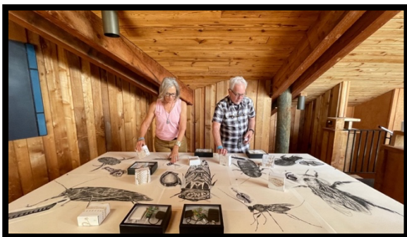
Figure 1. The artists interacting with Secret Reception.

Secret Reception is a sonic installation that combines art, bioacoustics and eco-musicology to creatively engage the general public in questions related to sound reception in the human and more-than-human worlds. This sonic art installation proposes new paradigms for understanding “hearing” or sound detection through the design and exhibition of tactile and haptic objects and interfaces that use vibration to transmit sonic information. Secret Reception expands the idea of what hearing is, and proposes sensory modalities not necessarily associated with conventional modes of human hearing. Drawing on scientific research that examines how insects hear or detect sound through a variety of body parts, we transpose insect sound detection to the human listening experience. Inspired by art and science, we provide the visitor with a haptic experience of sound impulses that emulate the way insects receive them while also possibly revealing interpretive melodic and rhythmic characteristics (Figure 1).