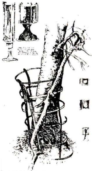
From Cells of Ourselves