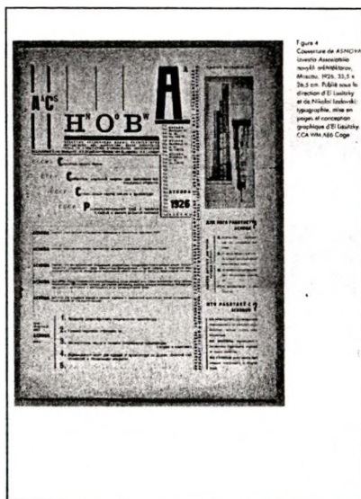
Fig. 7 Dessins d'architecture de l'avant-garde soviétique p. 1

Gallery/museum exhibition catalogues have always featured among the Alcuin prize winners in this category—as they should, since they are typically subsidized and designed by people particularly conscious of artistic considerations. The thoughtful work put into the catalogues of the Centre canadien d'architecture/ Canadian Centre for Architecture in Montreal is well represented in the first two prize winners. (These are, incidentally, published in both English and French editions; it just happens that the publisher submitted in this competition the English edition of one and the French edition of the other.) The first prize acknowledges the particularly complex problems posed by the content of this catalogue. The second prize acknowledges (like the first prize in the previous category) a perfect matching of design to the Bauhaus-influenced style of the inter-war period with which it deals. The full-length sewing of its single signature is a technical feature also worth mention. The National Gallery's Sterbak catalogue has a particularly successful cover as well as dealing with the two-column English/French layout with many intra-text illustrations successfully. The book of Sam Tata portraits deserves mention for its careful layout and production by a designer/printer often previously acknowledged in these Alcuin awards.