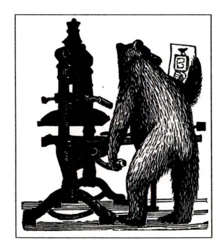
Fig. 15 Utile Dulci

This year's prizes for limited editions go to one quite thin book and one very large book. The Elsteds' book, dated 1988 but only completed and published three years later, is worth the wait in every way. The two-colour presswork is sharp and even; the tipped-in halftones and woodcuts match the overall colouration of the printed pages. Second prize also goes to a bibliography; a lavish production generously spaced out on thick paper with a deckle fore-edge and a very sturdy binding. The text is sensibly presented without right-justification. The presswork, in letterpress as with the other winner, is impeccable; the lithographed halftones are equally well executed.