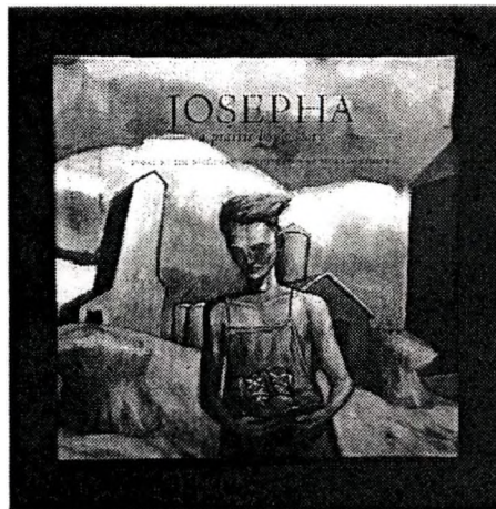
1st Prize: Juvenile Books; Josepha: A Prairie Boy's Story