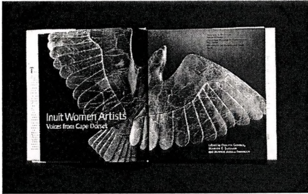
2nd Prize: Gen. Trade Books (Adult Picture & Photography): Inuit Women Artists: Voices from Cape Dorset.