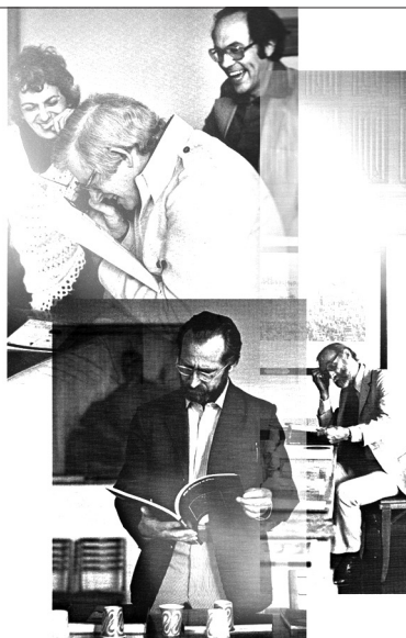
A M P H O R A No. 174 | Fall 2016 THE ALCUIN SOCIETY