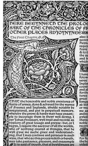
AMPHORA No. 172 | Spring 2016 THE ALCUIN SOCIETY

The Alcuin Society, P.O. Box 3216 Vancouver, British Columbia Canada V6B 3X8