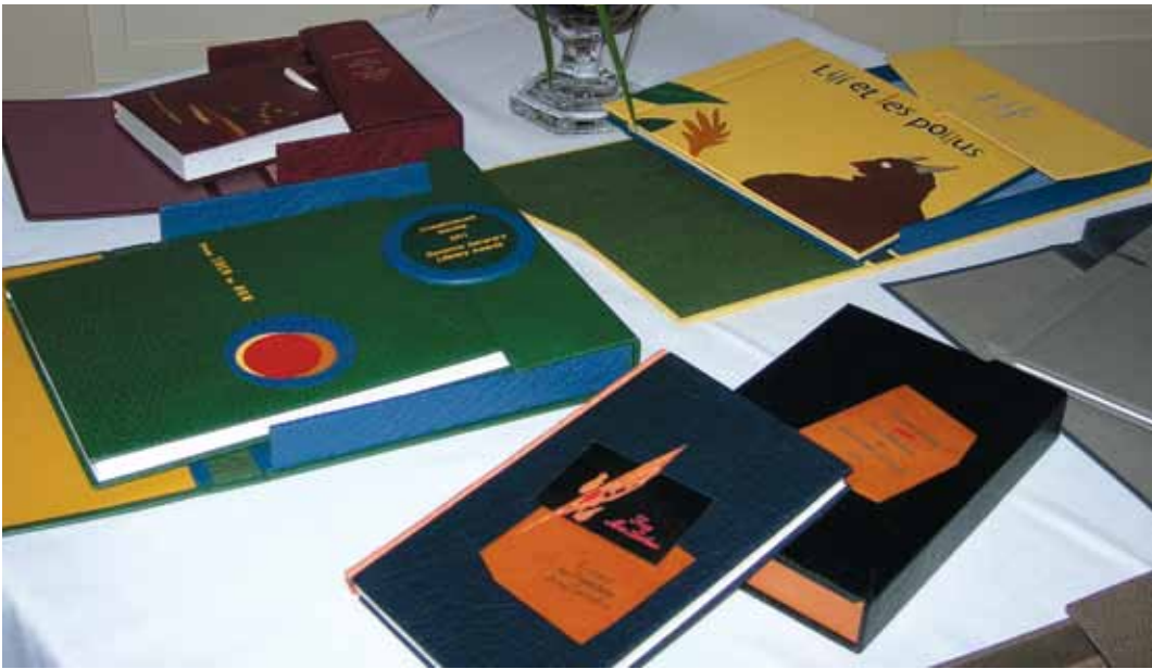
Book display at the gala ceremony for the Governor General's Literary Awards, November 2011.

to the collection of all previous award-winning books over those 75 years, numbering over 600. During her tenure as governor general, Adrienne Clarkson undertook to research and obtain copies of all previous award-winning books for Rideau Hall's library. An exhibition of the books will be open to the public at Rideau Hall throughout the 75th-anniversary year, until November 2012.