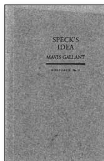
No. 11 Speck's Idea MAVIS GALLANT

See www.biblioasis.com/catalogue for more information.