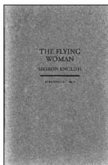
No. 9 The Flying Woman SHARON ENGLISH