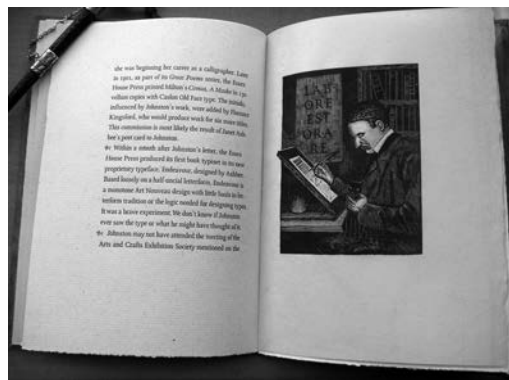
From A Letter from Edward Johnston.