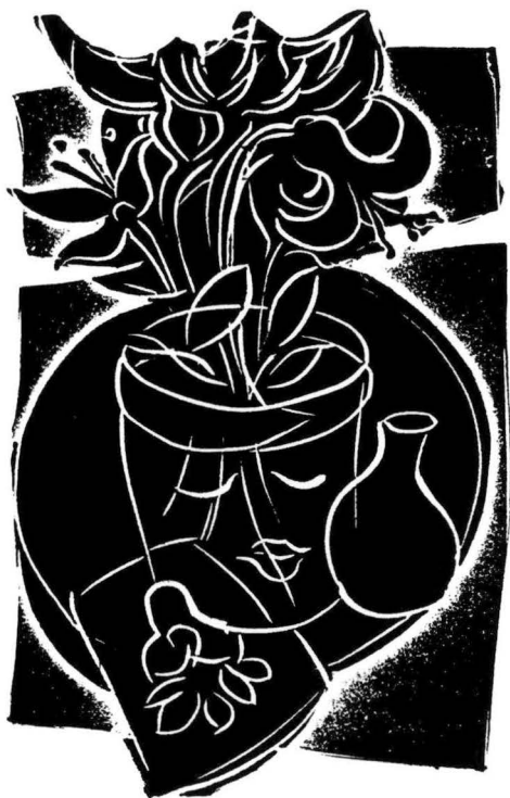
A Girl Transformed © 2003 Alex Lavdovsky

Prices for all these books include shipping and handling within Canada. For further information about Poppy Press, including ordering information, see their website at http://www.poppypress.com , or write to Poppy Press Publishing Ltd., S123A 645 Fort Street, Victoria, B.C., V8W 1C2.