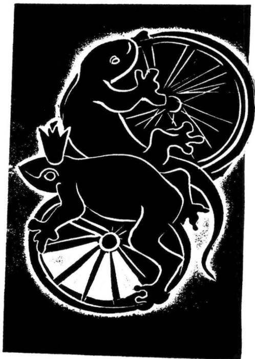
Fairy Tale © 2003 Alex Lavdovsky