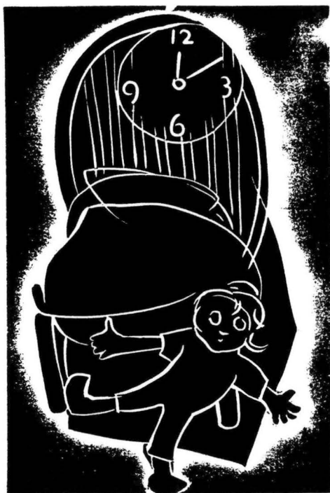
He Looks After © 2003 Alex Lavdovsky

Sold only as a set each volume is perfect-bound by hand, featuring quality archival paper as well as letter-press printing. Traditional wooden type has been used in the creation of the illustrations for both books as well as the embossed slipcase. The books are designed by Alexander Lavdovsky who also contributes an original fine-art print with each volume. The edition is limited to 500 numbered sets of which only 200 are signed by both author and artist. Numbers 1-200 (signed by author and artist) are $190.00. Numbers 201-500 (signed by the artist only) are $125.00.