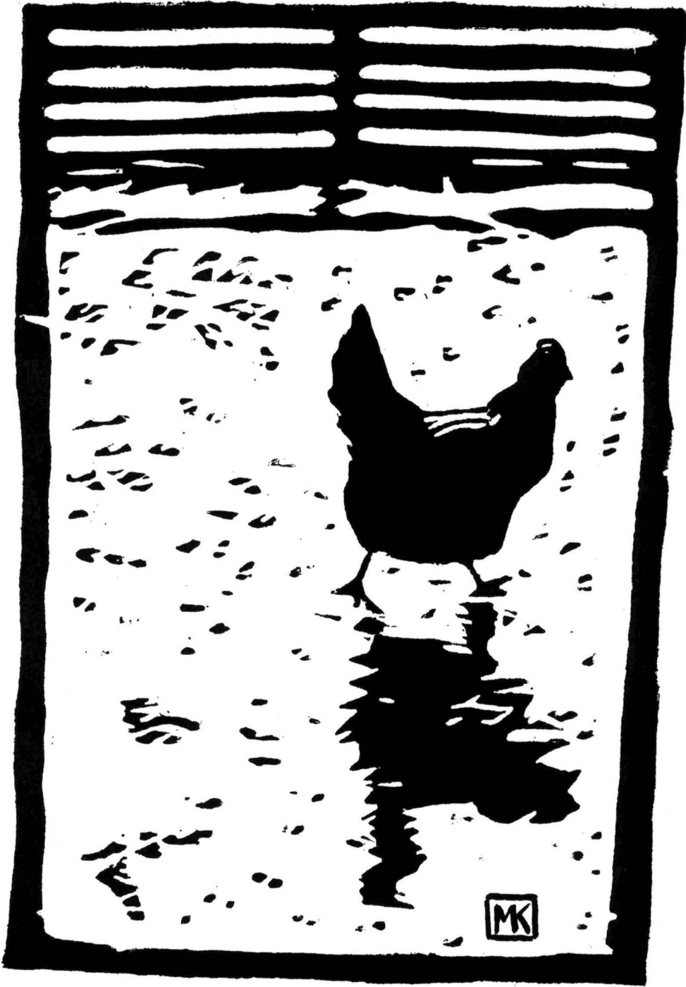
Purposeful Hen