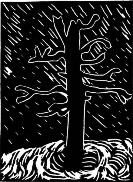
Tree, Mt Brunswick