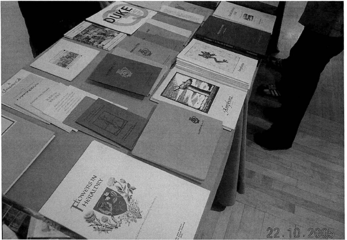
Table displaying publications of the Alcuin Society.