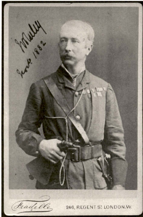
Cabinet Card of Field Marshal Garnet Wolseley

Wanted: Vintage Photographs & Photo Albums. Arctic, Western Canada, Klondike, Indians, NWMP, Canadian Rockies, as well as China, Japan and Africa