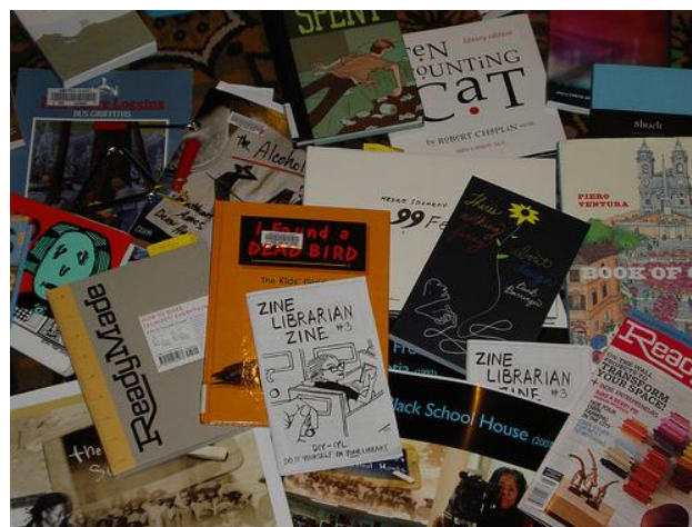
Books, magazines, DVDs, zines, and more! Some of the seventy colourful items that were reviewed in this session.