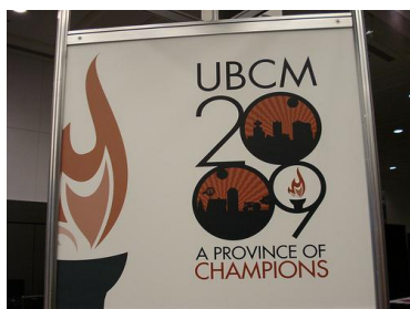
UBCM's 2009 Convention logo and theme.

The reception was a great success, with approximately 450 people in attendance – this was a good 150 more than in previous years, which was a pleasant surprise for the event organizers! Among the attendees were many, many local government elected officials, as well as a solid provincial contingent of MLAs and staff. Also of note were the many library sector representatives – both trustees and staff – who made the trip downtown to mingle and connect with our local and provincial politicians.