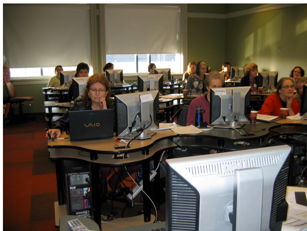
Participants in the November workshop learn how to use EXCEL to analyze a library collection.