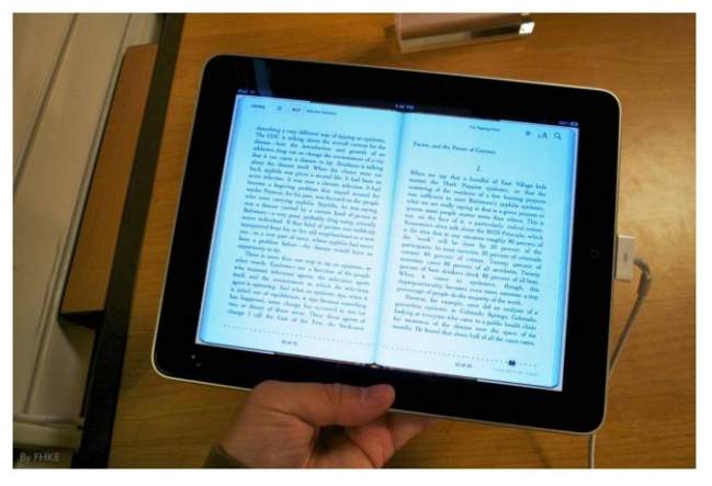
From Wikimedia Commons. An iPad.

So, when we're discussing e-books, we need to be very clear at the outset whether we're, figuratively, on the same page . . . (pun intended) . . . fiction or non-fiction. There isn't a black and white answer here but the usability, usefulness and user satisfaction of the e-book experience is quite different on this point. Now that we've discussed the major differences between fiction and no-fiction, we need to address the other major types of non-fiction ebook works.