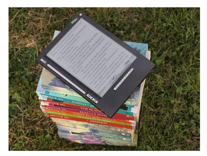
From Wikimedia Commons. A stack of "books".

editorial anthologies imitate periodicals more than books. Of course, they're also a format of books, like fiction, in general but other subtypes of books – textbooks, encyclopedias, fiction, audio-books, talking books, large print, translations, Braille, and more are mutating in the market. One of the dysfunctions in our conversations about e-books is that it often happens that the transmogrification of a book into an e-book does more than just change the format.