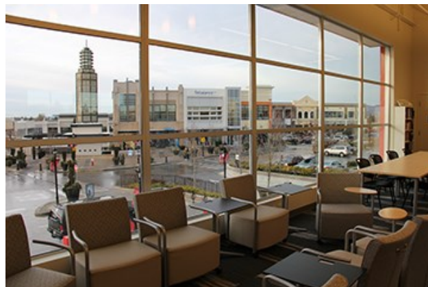
Emily Carr Branch at Uptown. Photo by Susie Jones, GVPL.

The new branch is a marked departure from the old branch with bright, modern fixtures and flexible space. Much of the building design is inspired by the library's namesake with the interior featuring reproductions of two of Emily Carr's paintings, Odds & Ends and Blue Sky , courtesy of the Art Gallery of Flexible seating and lots of natural light at the new