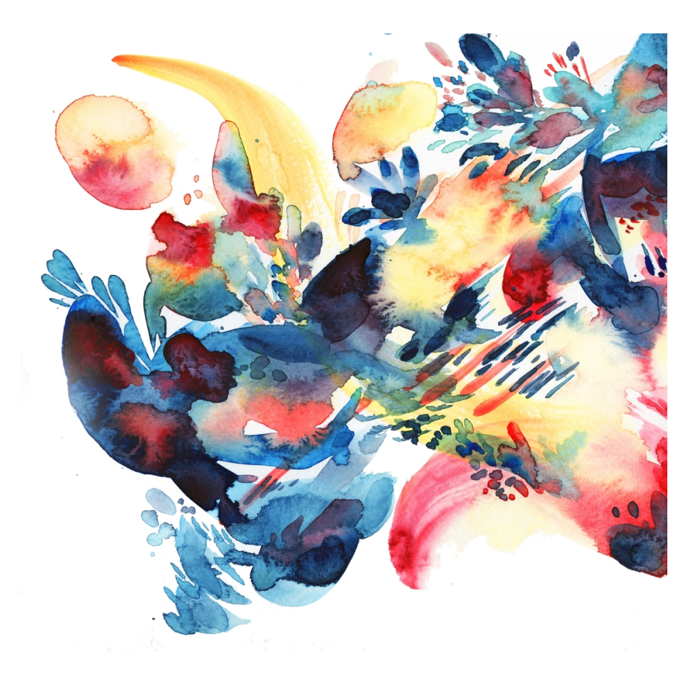
This painting, "Sunrise," is from Queenie Wong's Mindfulness Collection. The splatters of paint in this image take on shapes including teardrops, lines, ovals, circles and other abstract shapes. The colours throughout this piece are red, midnight blue, cadet blue, light blue, yellow, and purple.

disagree, ask questions, and say "no" at any given time. As a collective effort to create something new, it was vital to build trust and support each other throughout the process.