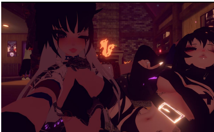
Published by @Cassandra Dimitrescu on 6 December, 2020