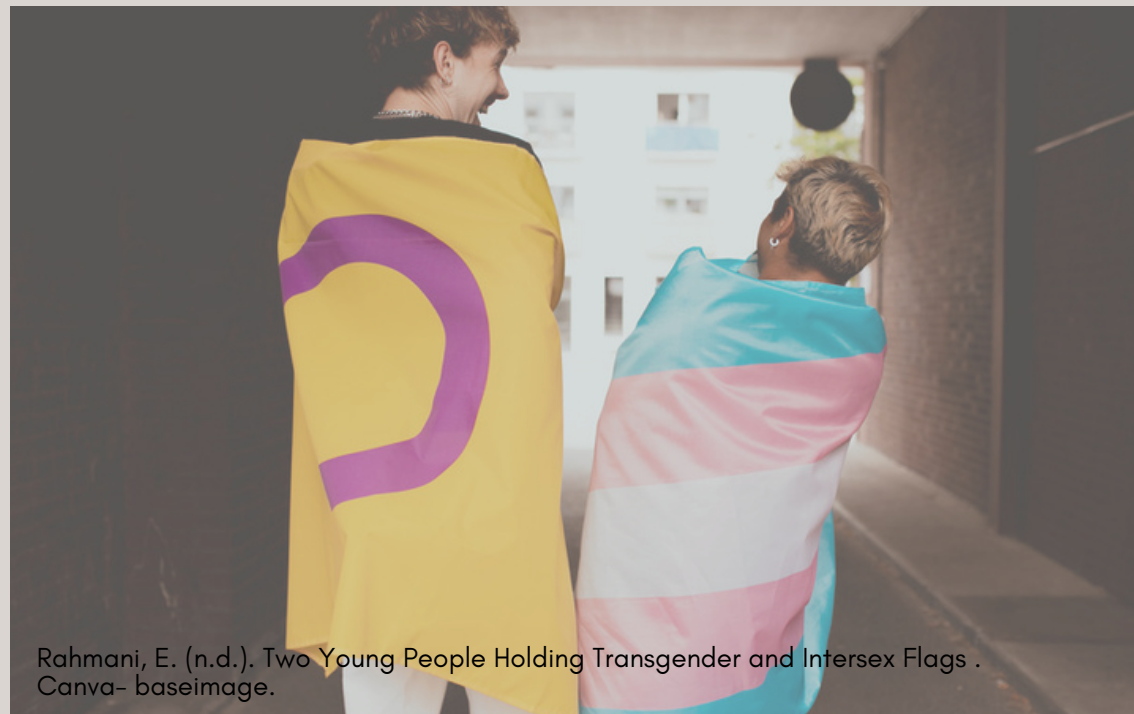
Rahmani, E. (n.d.). Two Young People Holding Transgender and Intersex Flags . Canva- baseimage.