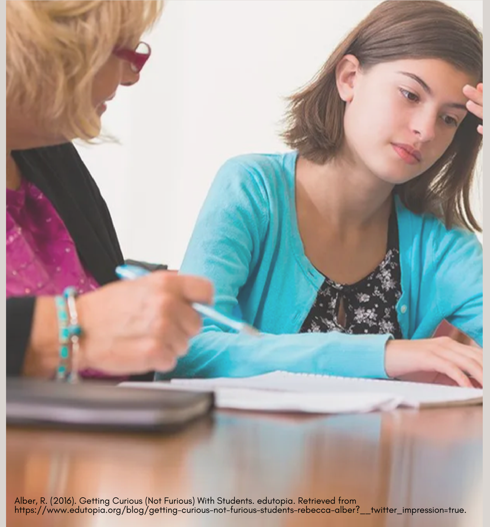
Alber, R. (2016). Getting Curious (Not Furious) With Students. edutopia. Retrieved from https://www.edutopia.org/blog/getting-curious-not-furious-students-rebecca-alber?__twitter_impression=true .