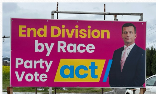
For national hui & Māori man images; CC BY 3.0—Credit: 1News Reporters For ACT party billboard image; CC BY 3.0—Credit: Nicky Hager