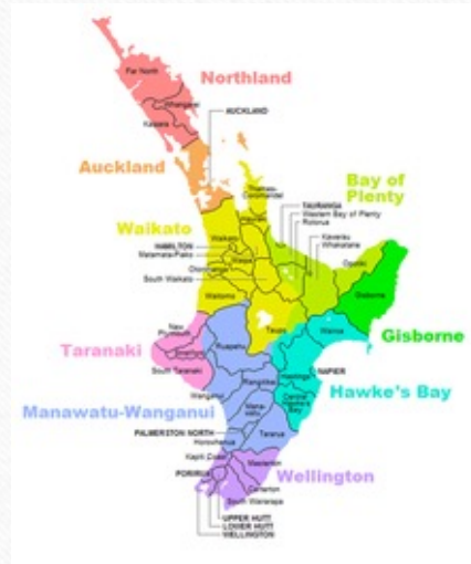
Right: Map of North Island of New Zealand