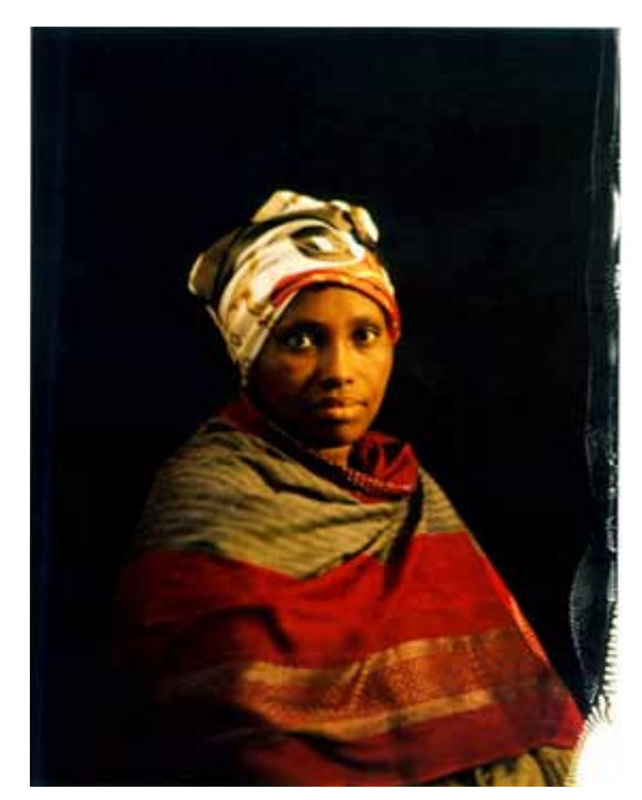
From the Portrait sessions, 2005.