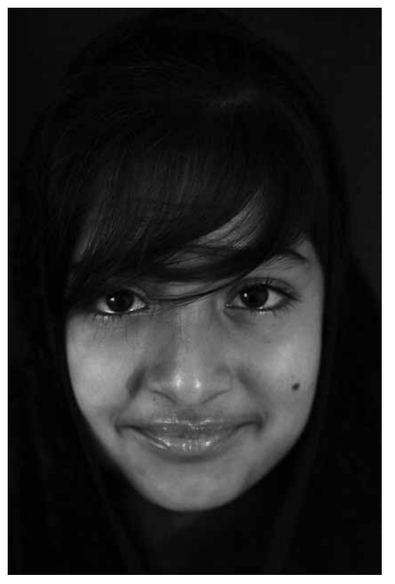
Young Snapper, 2010.

Poster from the buses: 'How I see you', Carrie from Scotland