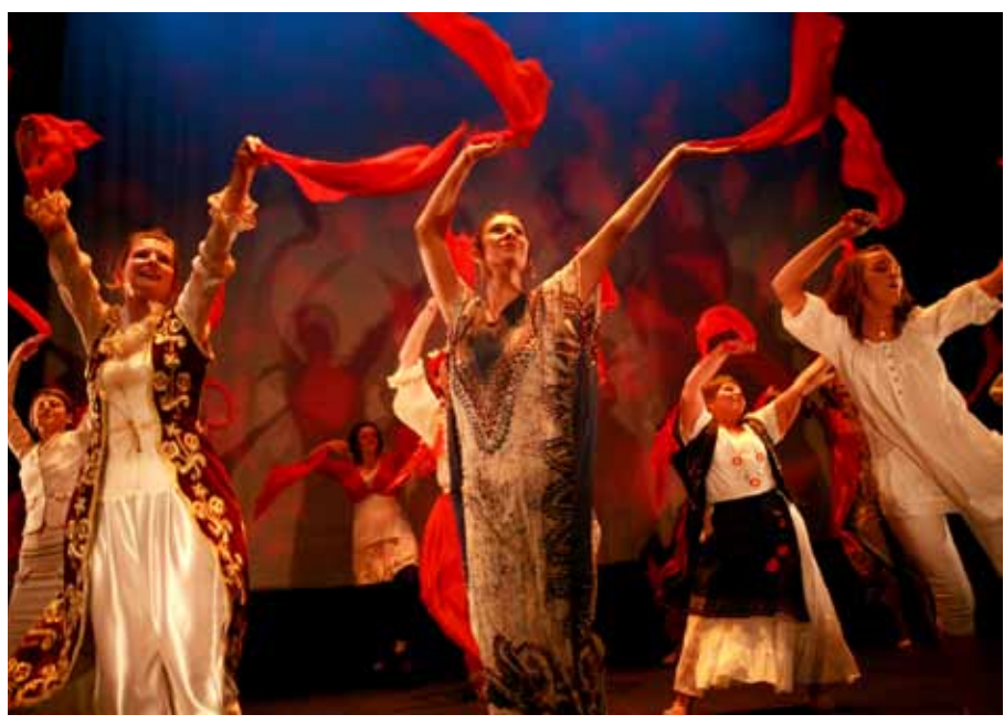
Back and Forth Finale, 2010. Performed as part of Scottish Refugee Week 2010, Maryhill Integration Network and Barrowland Ballet perform 'Back and Forth' exploring the theme of Journeys. Dancers from Maryhill Integration Network's Music and Theatre Production Project perform a medley of dances from Africa, Latvia, Iran, Kosova and USA as the finale for Back and Forth, in partnership with Barrowland Ballet.