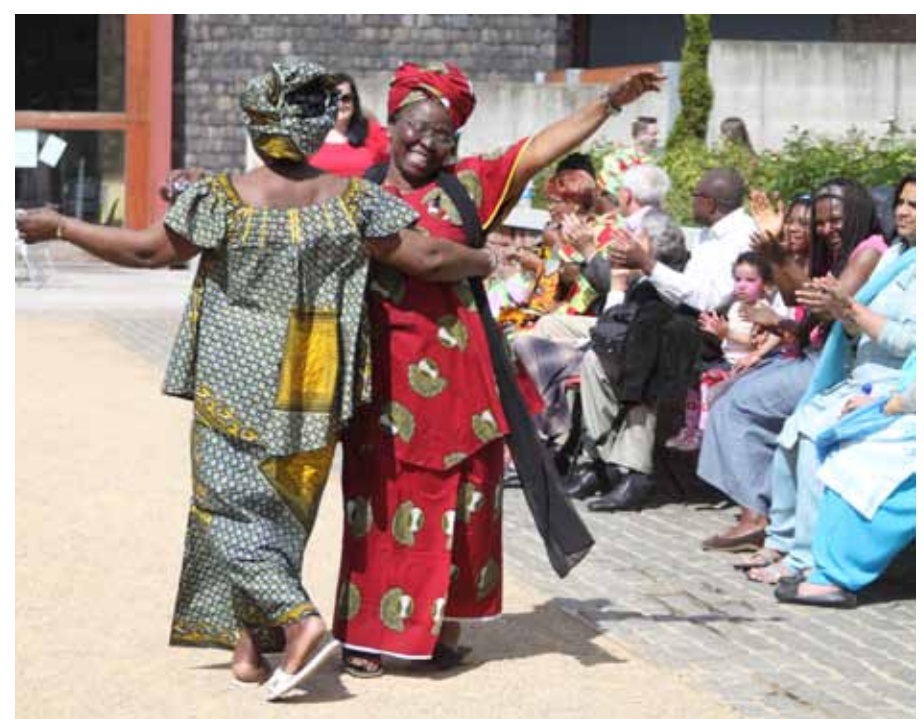
Karibu: Two Women Dancing