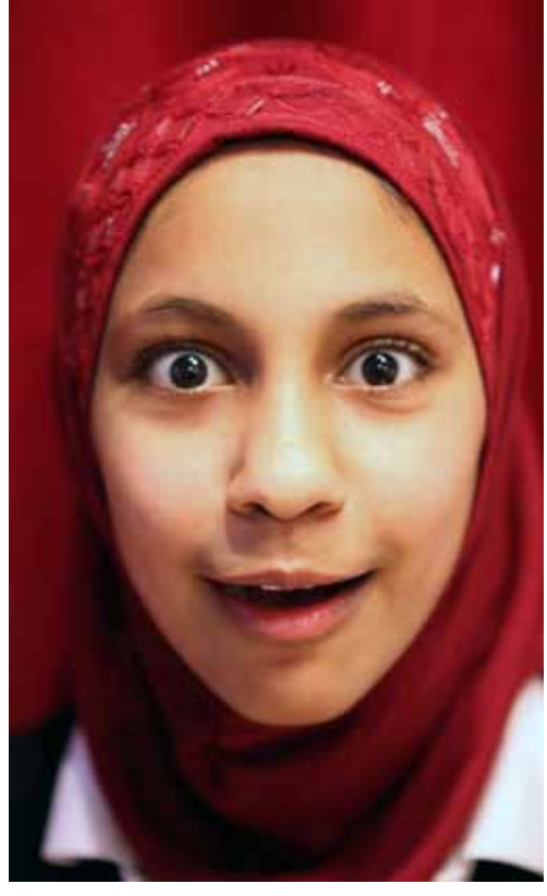
Young Snapper, 2010.