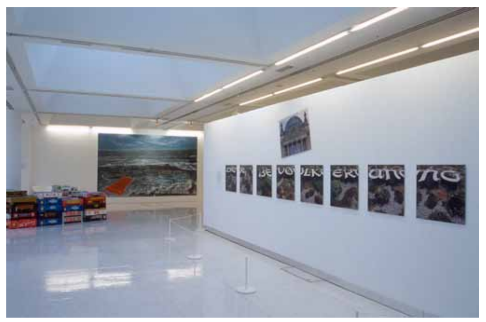
Sanctuary: the Exhibition, View of Gallery 1