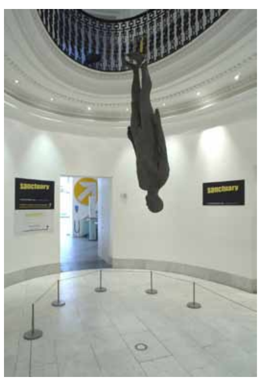
This stunning piece is Earthbound by Antony Gormley (2003) as it was displayed in GoMA for Sanctuary: the Exhibition .